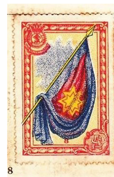
8 The Army Flag stamp was number 8.