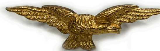
Laurie's Royal New Zealand Air Force cap badge.