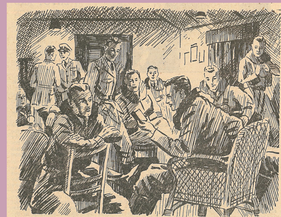
THE SALT OF GOD'S WORD IN AN AERODROME.—An incident of the present war. A pilot officer reads from the New Testament to his fellow-pilots as they are waiting for the word to take the air for the night's operations.

We would love to know your family's story connected to men and women in military service, and please consider donating pertinent material to Archives.