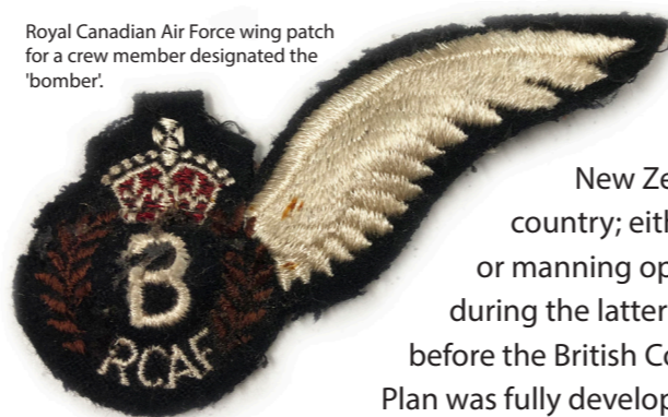
Royal Canadian Air Force wing patch for a crew member designated the 'bomber'.

During the war, the RNZAF contributed 2,743 fully trained pilots to serve with the RAF in Europe, the Middle East, and Far East. Another 1,521 pilots who