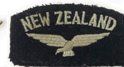
WWII Royal New Zealand Air Force shoulder patch.

away in military service. This included while training in Canada and when later he was based in the United Kingdom.