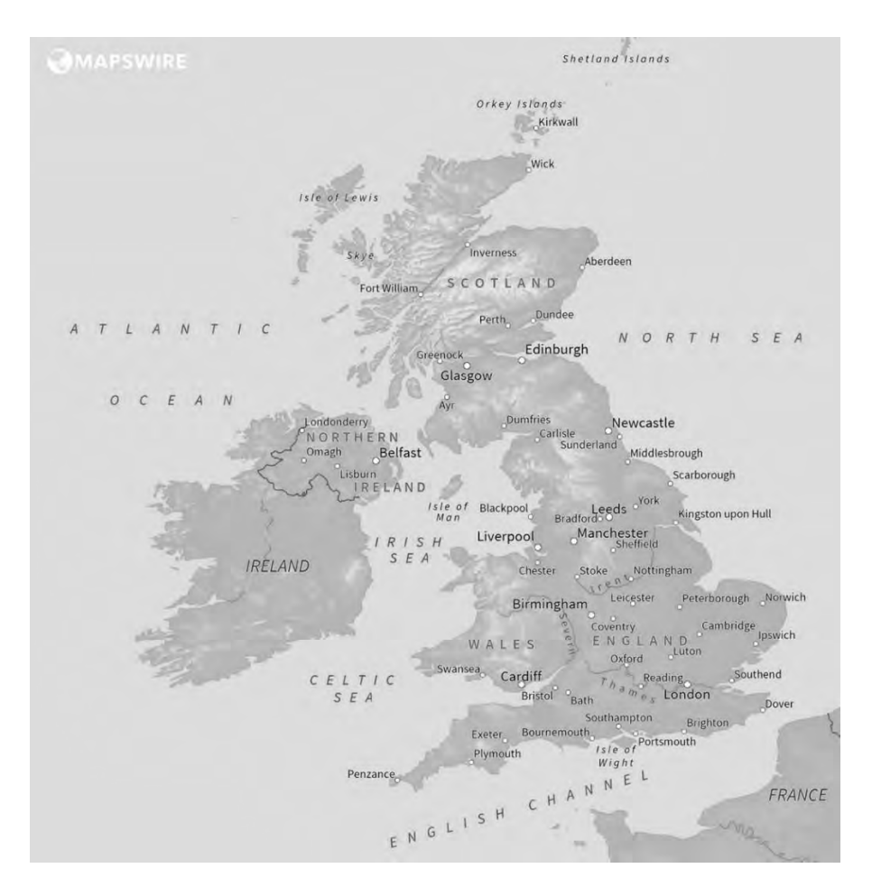
Country Background Information