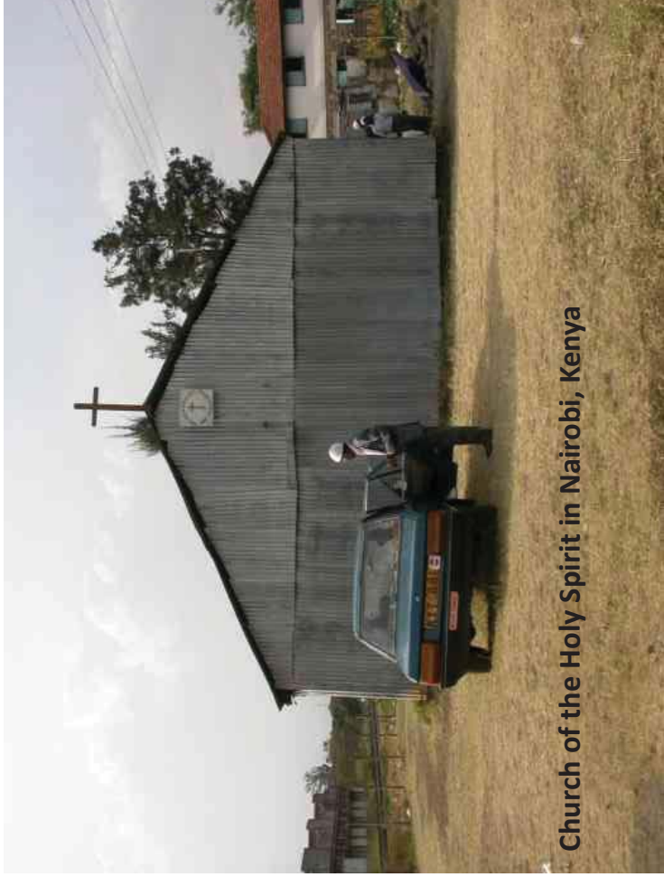
Church of the Holy Spirit in Nairobi, Kenya