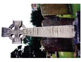
St Peters Church - Cross in graveyard