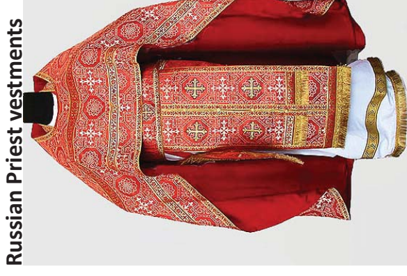
Russian Priest vestments