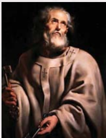
The Apostle Peter