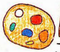
Tusitusi ma faamaumau mea o tutupu