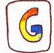
Faitau ma fetalai le mafau i tusitusiga i luga o le initaneti