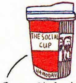
Taumafa faatasi se ipu kofe ma uo