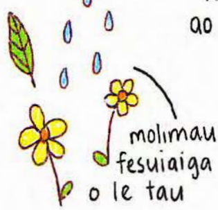
molimau fesuaiga o le tau