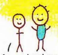
Aoga tusi paia