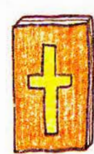
Tusi Paia - toe tomanatu i afioga a le Atua