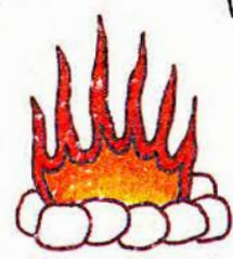
Tafu le afi