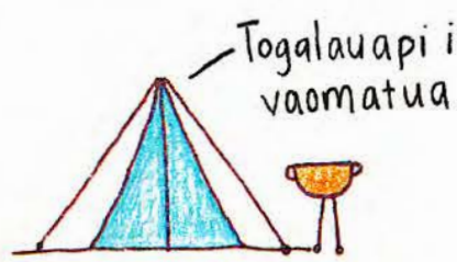
Togalauapi i vaomatua