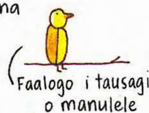
Faalogo i tausagi o manulele