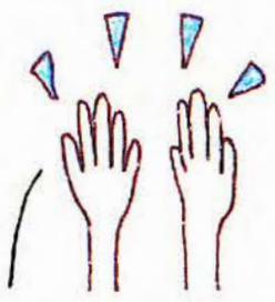
Tuina atoa le mafau i Viiga o le Atua