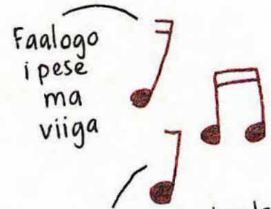
Faalogo i pese ma viiga