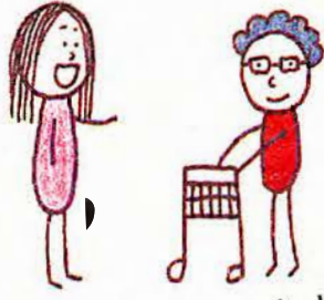
Faasoa tala ma isi