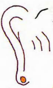
Nofo filemu ma faalogo ao fetalai le Atua