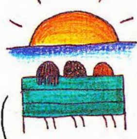
Faasavili i matafaga