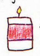
Faatoafilemu le agaga i moli gao