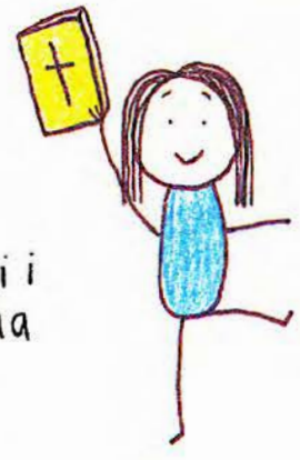
siva i pese ma viiga