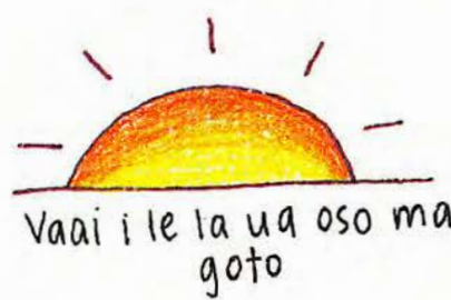
Vaai i le la ua oso ma goto