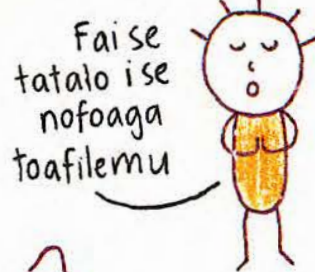
Faise tatalo ise nofoaga toafilemu