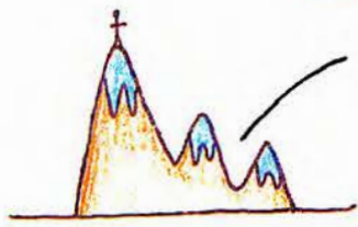
Ae i tumutumu mauga