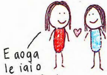
E aoga le iai o se faufautua e maua ai aoaoga lelei