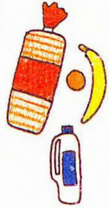
Fesoasoani i tagata puapuagatia