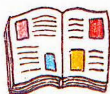
Faitau upu folafola i aso uma