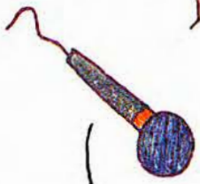
Faalogo i tautinoga