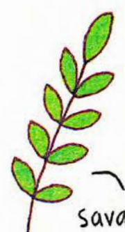
savalivali i le Siosiomaga